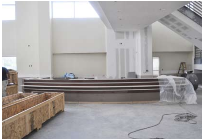
The main client reception desk just recently arrived and should be completed soon.