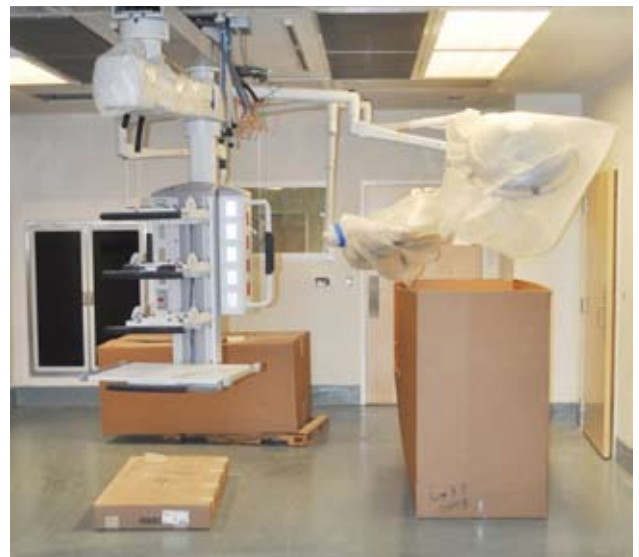
Operating room lights and booms will soon be installed.